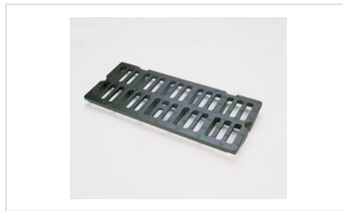
Grating MECALINEA C250 - Dimensions of concrete channels

The information on this sketch is, to the best of our knowledge correct at the time of printing. However Saint-Gobain are constantly looking at ways of improving their products and services therefore reserve the right to change without prior notice, any of the data shown. Any orders placed will be subject to our Standard Conditions of Sale, available on request.