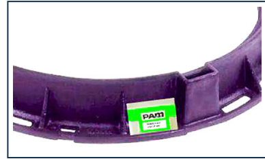
PAMREX / VIATOP 800 manhole covers with opening assisted