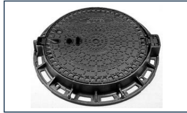
PAMREX / VIATOP manhole covers