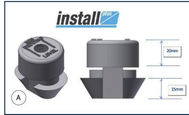
Install Plus - Frame Levelling System before bedding

The information on this sketch is, to the best of our knowledge correct at the time of printing. However Saint-Gobain are constantly looking at ways of improving their products and services therefore reserve the right to change without prior notice, any of the data shown. Any orders placed will be subject to our Standard Conditions of Sale, available on request.