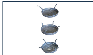
Mudpan for PAMREX manhole covers