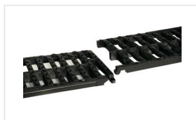
Grating AUTOLINEA D400 - Dimensions of concrete channels