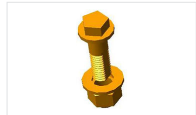
¼ turn locks