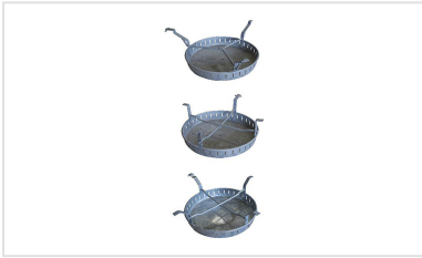
Mudpan for PAMREX manhole covers