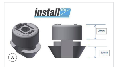
Install Plus - Frame Levelling System before bedding