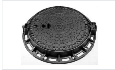
PAMREX / VIATOP manhole covers