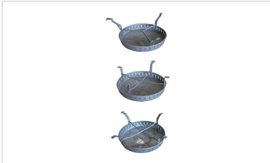
Mudpan for PAMREX manhole covers