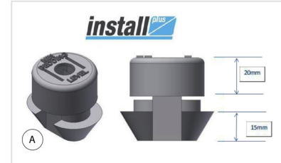
Install Plus - Frame Levelling System before bedding

The information on this sketch is, to the best of our knowledge correct at the time of printing. However Saint-Gobain are constantly looking at ways of improving their products and services therefore reserve the right to change without prior notice, any of the data shown. Any orders placed will be subject to our Standard Conditions of Sale, available on request.