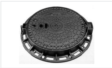
PAMREX / VIATOP manhole covers