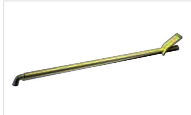
Accessories for Manhole Covers: operating key C24 for PAMREX, VIATOP and VIATOP 2 Manhole covers