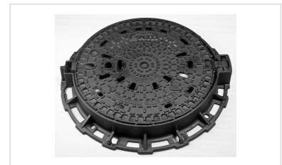
Anti-theft pins for PAMREX / VIATOP 600 and 700 / VIATOP 2 manhole cover