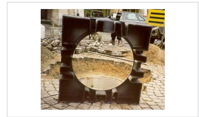
Manhole cover PAMREX 600 - D400 class - Installation of the manhole cover with apparent frame