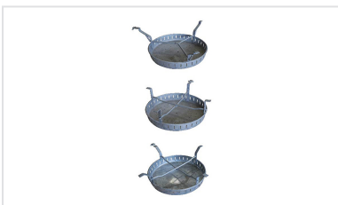
Mudpan for PAMREX manhole covers