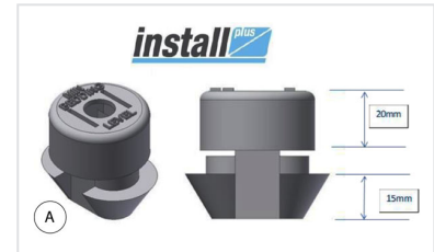
Install Plus - Frame Levelling System before bedding

The information on this sketch is, to the best of our knowledge correct at the time of printing. However Saint-Gobain are constantly looking at ways of improving their products and services therefore reserve the right to change without prior notice, any of the data shown. Any orders placed will be subject to our Standard Conditions of Sale, available on request.