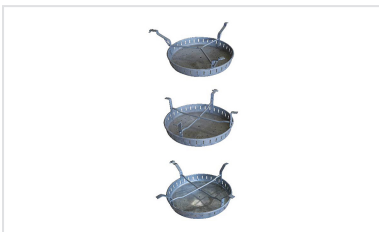
Mudpan for PAMREX manhole covers