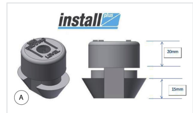
Install Plus - Frame Levelling System before bedding

The information on this sketch is, to the best of our knowledge correct at the time of printing. However Saint-Gobain are constantly looking at ways of improving their products and services therefore reserve the right to change without prior notice, any of the data shown. Any orders placed will be subject to our Standard Conditions of Sale, available on request.