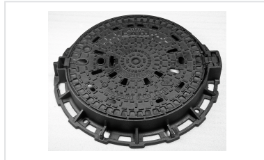
Anti-theft pins for PAMREX / VIATOP 600 and 700 / VIATOP 2 manhole cover