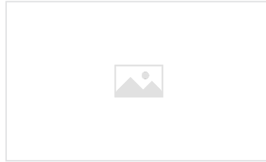
Identification of PAMREX manhole covers versions