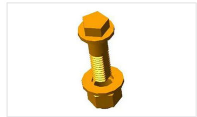
¼ turn locks