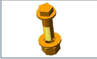
1/4 turn locks

The information on this sketch is, to the best of our knowledge correct at the time of printing. However Saint-Gobain are constantly looking at ways of improving their products and services therefore reserve the right to change without prior notice, any of the data shown. Any orders placed will be subject to our Standard Conditions of Sale, available on request.