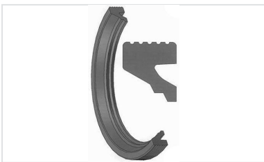
IM Seal for gravity fittings

The information on this sketch is, to the best of our knowledge correct at the time of printing. However Saint-Gobain are constantly looking at ways of improving their products and services therefore reserve the right to change without prior notice, any of the data shown. Any orders placed will be subject to our Standard Conditions of Sale, available on request.