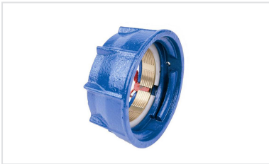
IZIFIT-K anchoring Gland

The information on this sketch is, to the best of our knowledge correct at the time of printing. However Saint-Gobain are constantly looking at ways of improving their products and services therefore reserve the right to change without prior notice, any of the data shown. Any orders placed will be subject to our Standard Conditions of Sale, available on request.