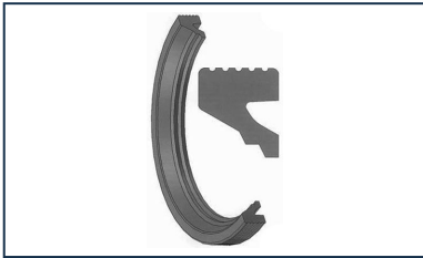
IM Seal for gravity fittings

The information on this sketch is, to the best of our knowledge correct at the time of printing. However Saint-Gobain are constantly looking at ways of improving their products and services therefore reserve the right to change without prior notice, any of the data shown. Any orders placed will be subject to our Standard Conditions of Sale, available on request.