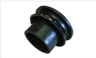
Reduction Joint for Connection Chamber

The information on this sketch is, to the best of our knowledge correct at the time of printing. However Saint-Gobain are constantly looking at ways of improving their products and services therefore reserve the right to change without prior notice, any of the data shown. Any orders placed will be subject to our Standard Conditions of Sale, available on request.