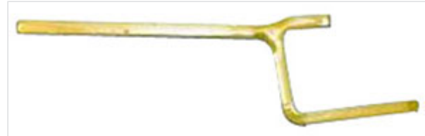
Wedges lever assembly support for Universal Ve / Alpinal / Tis-K Joint