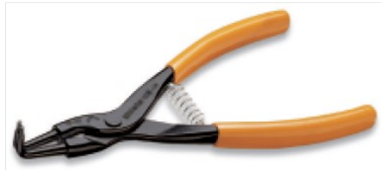
Clamp to install wedge assembly support for Universal Ve / Alpinal / Tis-k Joint