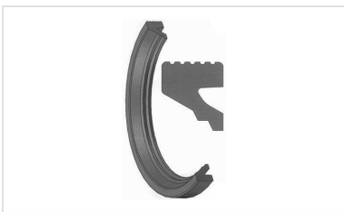
IM Seal for gravity fittings

The information on this sketch is, to the best of our knowledge correct at the time of printing. However Saint-Gobain are constantly looking at ways of improving their products and services therefore reserve the right to change without prior notice, any of the data shown. Any orders placed will be subject to our Standard Conditions of Sale, available on request.