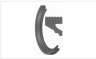
IM Seal for gravity fittings

The information on this sketch is, to the best of our knowledge correct at the time of printing. However Saint-Gobain are constantly looking at ways of improving their products and services therefore reserve the right to change without prior notice, any of the data shown. Any orders placed will be subject to our Standard Conditions of Sale, available on request.