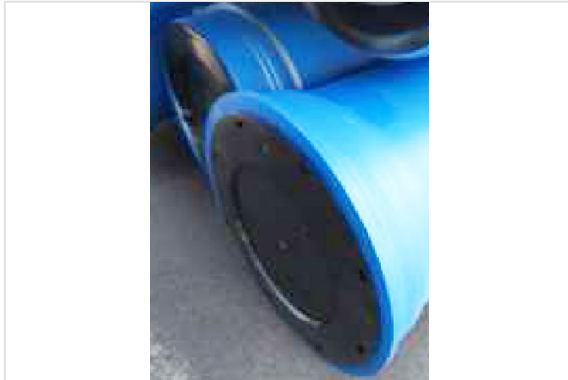
Polyethylene caps DN350-600