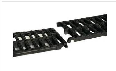
Grating AUTOLINEA C250 - Dimensions of concrete channels

The information on this sketch is, to the best of our knowledge correct at the time of printing. However Saint-Gobain are constantly looking at ways of improving their products and services therefore reserve the right to change without prior notice, any of the data shown. Any orders placed will be subject to our Standard Conditions of Sale, available on request.