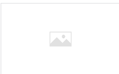
Assembly and disassembling of the AUTOLINEA gratings