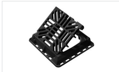
Opening, disassembling and reassembly DEDRA 400 grating D400 class

The information on this sketch is, to the best of our knowledge correct at the time of printing. However Saint-Gobain are constantly looking at ways of improving their products and services therefore reserve the right to change without prior notice, any of the data shown. Any orders placed will be subject to our Standard Conditions of Sale, available on request.