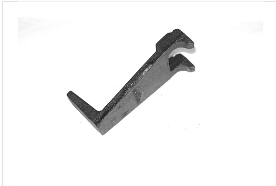
Cover anti-theft spline for manhole cover TEK / B-TEC