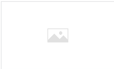
Manhole covers and gully grates C250 and D400 class