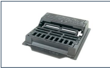
Gully units SELECTA 500 and MAXI C250 - Implementation

The information on this sketch is, to the best of our knowledge correct at the time of printing. However Saint-Gobain are constantly looking at ways of improving their products and services therefore reserve the right to change without prior notice, any of the data shown. Any orders placed will be subject to our Standard Conditions of Sale, available on request.