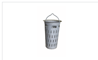
Mudpan for Gratings SQUADRA and DEDRA 400

The information on this sketch is, to the best of our knowledge correct at the time of printing. However Saint-Gobain are constantly looking at ways of improving their products and services therefore reserve the right to change without prior notice, any of the data shown. Any orders placed will be subject to our Standard Conditions of Sale, available on request.