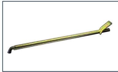
Accessories for Manhole Covers: operating key C24 for PAMREX, VIATOP and VIATOP 2 Manhole covers

The information on this sketch is, to the best of our knowledge correct at the time of printing. However Saint-Gobain are constantly looking at ways of improving their products and services therefore reserve the right to change without prior notice, any of the data shown. Any orders placed will be subject to our Standard Conditions of Sale, available on request.