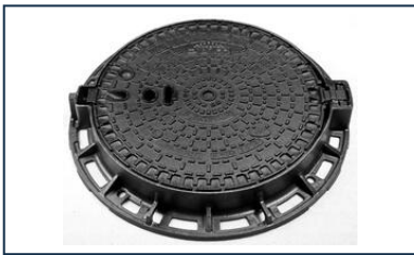
PAMREX / VIATOP manhole covers