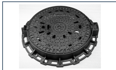
Anti-theft pins for PAMREX / VIATOP 600