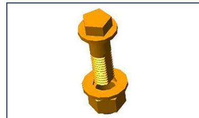
¼ turn locks