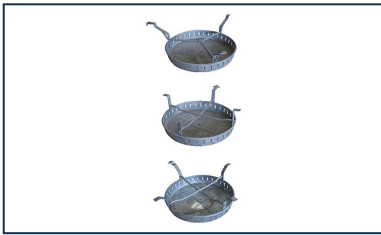
Mudpan for PAMREX manhole covers