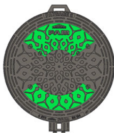
Upper and lower segment