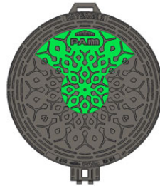
Upper and middle segment