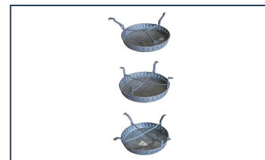
Mudpan for PAMREX manhole covers