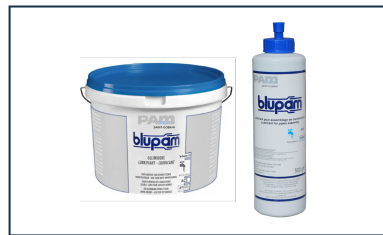
Lubricating paste - BLUPAM