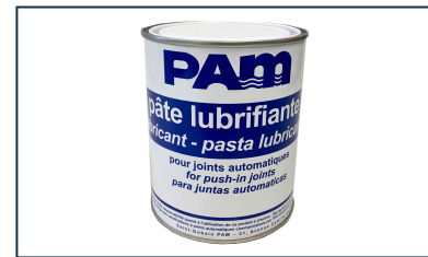
Lubricating paste - NATURAL, INTEGRAL, and PLUVIAL ranges