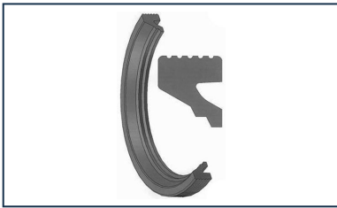
IM Seal for gravity fittings

The information on this sketch is, to the best of our knowledge correct at the time of printing. However Saint-Gobain are constantly looking at ways of improving their products and services therefore reserve the right to change without prior notice, any of the data shown. Any orders placed will be subject to our Standard Conditions of Sale, available on request.