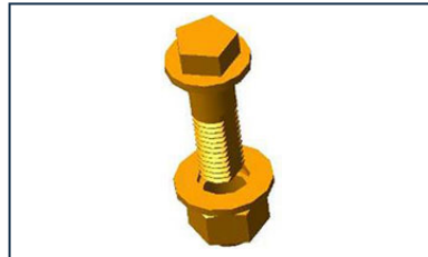
1/4 turn locks