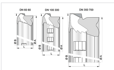
junta STD Vi para Tubos e acessórios DN60-700