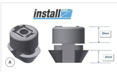
Install Plus - Frame Levelling System before bedding

The information on this sketch is, to the best of our knowledge correct at the time of printing. However Saint-Gobain are constantly looking at ways of improving their products and services therefore reserve the right to change without prior notice, any of the data shown. Any orders placed will be subject to our Standard Conditions of Sale, available on request.