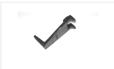
Cover anti-theft spline - Manhole cover TEK and B- TEC

The information on this sketch is, to the best of our knowledge correct at the time of printing. However Saint-Gobain are constantly looking at ways of improving their products and services therefore reserve the right to change without prior notice, any of the data shown. Any orders placed will be subject to our Standard Conditions of Sale, available on request.