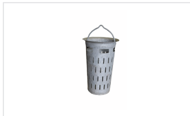
Mudpan for Gratings SQUADRA and DEDRA 400

The information on this sketch is, to the best of our knowledge correct at the time of printing. However Saint-Gobain are constantly looking at ways of improving their products and services therefore reserve the right to change without prior notice, any of the data shown. Any orders placed will be subject to our Standard Conditions of Sale, available on request.