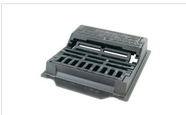
Gully units SELECTA 500 and MAXI C250 - Implementation

The information on this sketch is, to the best of our knowledge correct at the time of printing. However Saint-Gobain are constantly looking at ways of improving their products and services therefore reserve the right to change without prior notice, any of the data shown. Any orders placed will be subject to our Standard Conditions of Sale, available on request.