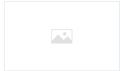
Manhole covers and gully grates C250 and D400 class