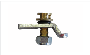
Locking kits PARXESS