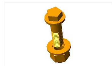
¼ turn locks

The information on this sketch is, to the best of our knowledge correct at the time of printing. However Saint-Gobain are constantly looking at ways of improving their products and services therefore reserve the right to change without prior notice, any of the data shown. Any orders placed will be subject to our Standard Conditions of Sale, available on request.