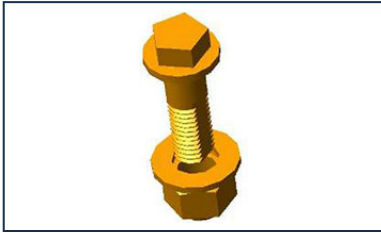
1/4 turn locks

The information on this sketch is, to the best of our knowledge correct at the time of printing. However Saint-Gobain are constantly looking at ways of improving their products and services therefore reserve the right to change without prior notice, any of the data shown. Any orders placed will be subject to our Standard Conditions of Sale, available on request.