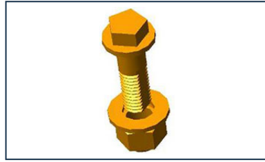
1/4 turn locks