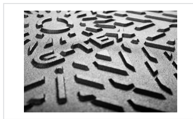
G-TEX - An innovating opening/closing concept