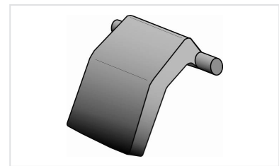
Cover anti-theft spine for Manhole cover KOREX 600 and BELSYS 600

The information on this sketch is, to the best of our knowledge correct at the time of printing. However Saint-Gobain are constantly looking at ways of improving their products and services therefore reserve the right to change without prior notice, any of the data shown. Any orders placed will be subject to our Standard Conditions of Sale, available on request.