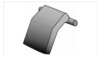
Cover anti-theft spine for Manhole cover KOREX 600 and BELSYS 600

The information on this sketch is, to the best of our knowledge correct at the time of printing. However Saint-Gobain are constantly looking at ways of improving their products and services therefore reserve the right to change without prior notice, any of the data shown. Any orders placed will be subject to our Standard Conditions of Sale, available on request.