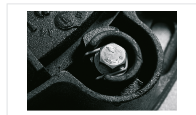
PAMTIGHT manhole covers - Anti-rotation clips