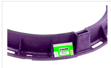
PAMREX / VIATOP 800 manhole covers with opening assisted