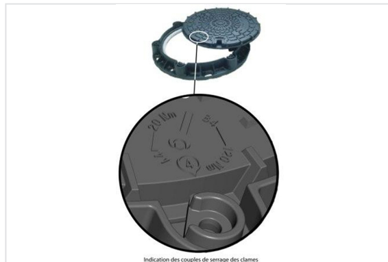
Torque for clamping claws