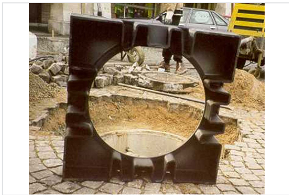
Example of installation on built manhole in bricks