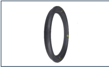
Standard G Gasket (STD G) for BIOGAN pipes and fittings DN150-200

The information on this sketch is, to the best of our knowledge correct at the time of printing. However Saint-Gobain are constantly looking at ways of improving their products and services therefore reserve the right to change without prior notice, any of the data shown. Any orders placed will be subject to our Standard Conditions of Sale, available on request.