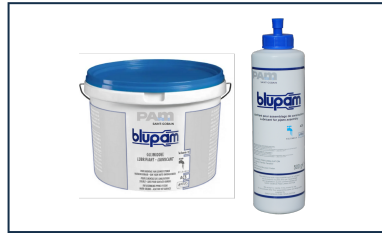
Lubricating paste - BLUPAM