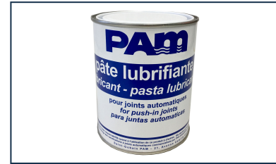
Lubricating paste - NATURAL, INTEGRAL, and PLUVIAL ranges

The information on this sketch is, to the best of our knowledge correct at the time of printing. However Saint-Gobain are constantly looking at ways of improving their products and services therefore reserve the right to change without prior notice, any of the data shown. Any orders placed will be subject to our Standard Conditions of Sale, available on request.