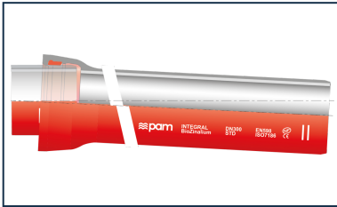
Kit Standard INTEGRAL Pipe + Standard Gasket